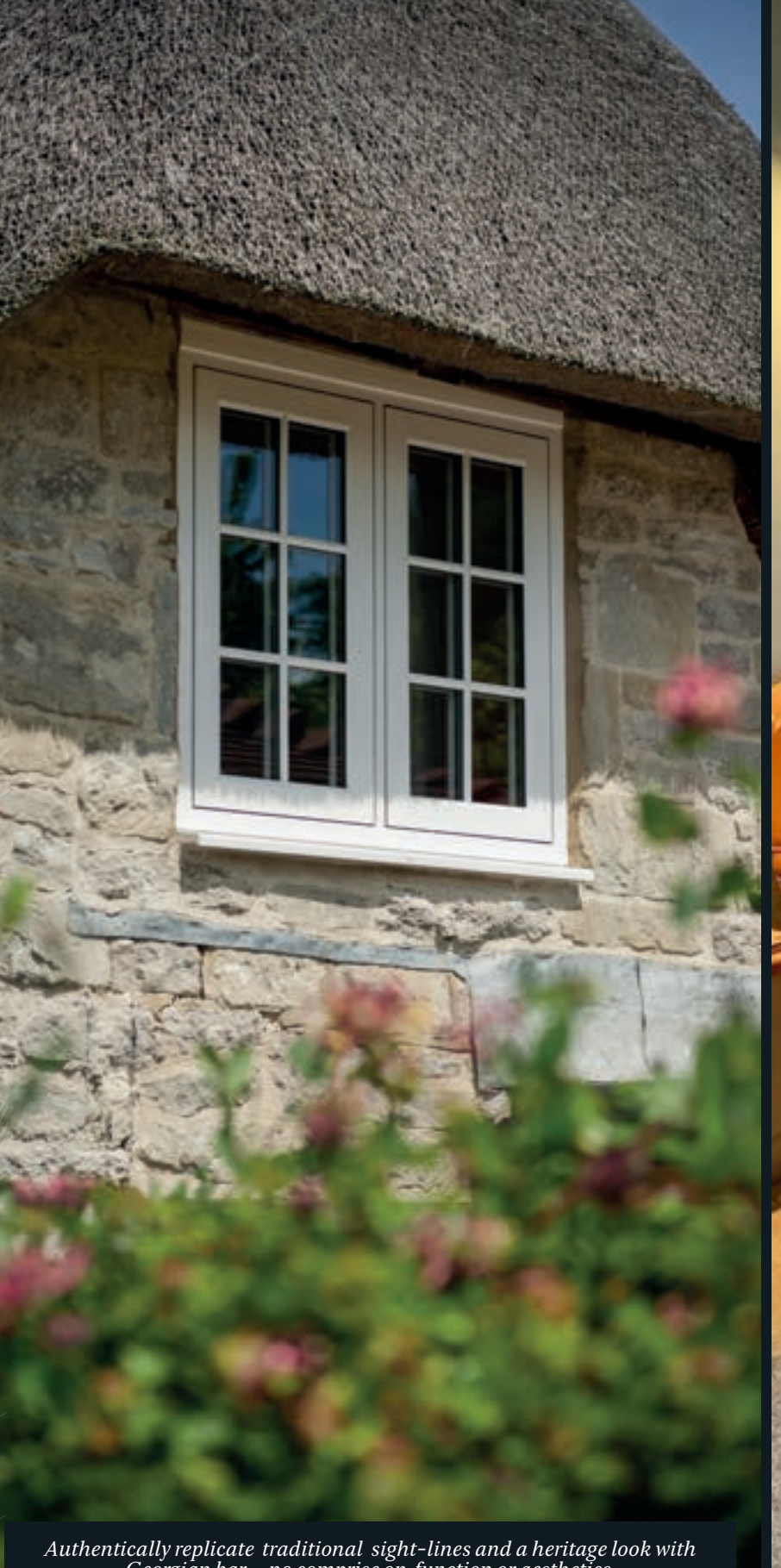
Georgian bar - no comprise on function or aesthetics.

For most homeowners, the style of their property will inform the design choices they make, so if you live in a Conservation Area Residence 9 can help enhance both appearance and performance, we have proven experience in helping to restore the original character of properties in hundreds of Conservation Areas, always with an eye to any planning considerations. We have also been approved in a number of Grade II Listed properties. If you are in a location with more design freedom R9 can help bring your ideas to life, balancing design and practicality to enhance your home, whilst still maintaining traditional looks.