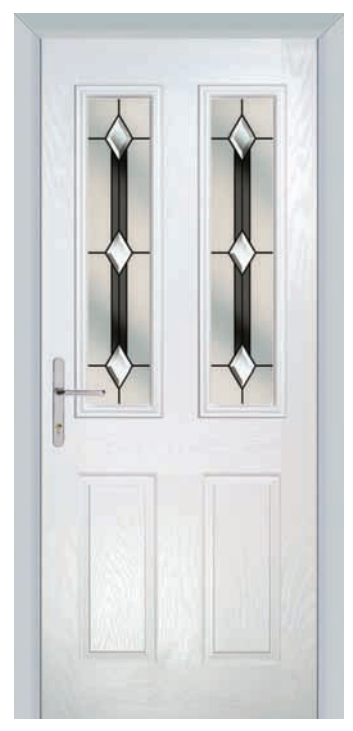
Etch Art Fusion Diamond Lead Square Lead